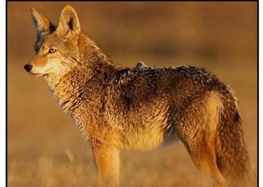
Again, note ears; snout; tail; and coat color/pattern, including narrow white band on lip