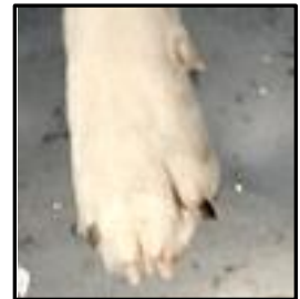
Dog (Husky) – note smaller size, more compact, and white nails