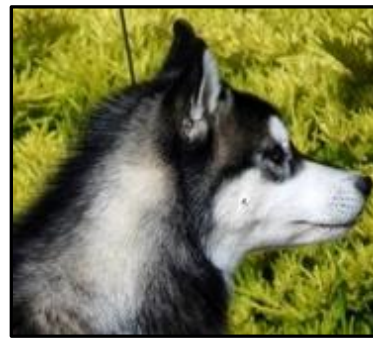
Dog (Husky) – note more pronounced forehead, rounder skull, and blockier/blunter/shorter muzzle