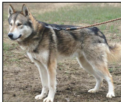
He may look quite wolfy, but this is a Tamaskan dog. Labeling him as a wolf would put his life in danger

Be aware that there are NO reliable DNA tests available to distinguish dogs from wolves/wolfdogs.