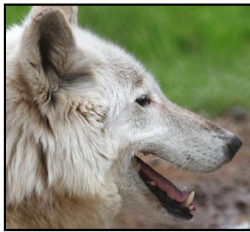
Wolf – note muzzle length and shape, and lack of pronounced forehead