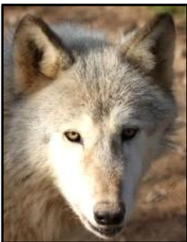
Wolf – note muzzle length and shape; and wedge shape of head