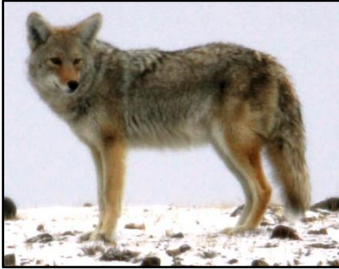
Note large, pointed ears; long tail; slender, pointed snout; and red tinge to legs and face

Coyotes are frequently mistaken for wolves, but can be distinguished by their smaller size (around half the weight of most North American wolves); larger, more pointed ears; more slender, pointed snout; shorter legs; longer tail; smaller paws; consistent grayish-brown coloration (almost no white or black coyotes) with more reddish/copper/cinnamon tinge to the fur, especially on the legs and muzzle; and only a narrow band of white fur around the upper lip: