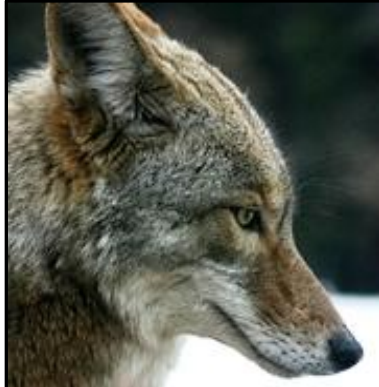
Note slender, pointed snout; red tinge to snout; and narrow band of white around lip