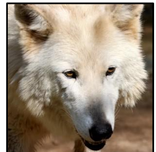
Wolf – note cheek ruffs