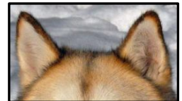
Dog (Husky) – note size, shape, thinness, less furred, and position on head