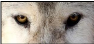
Wolf – note “slanted” angle of eyes