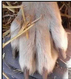
Wolf – note tan/taupe nails (not white/clear), even on white animal